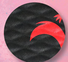
Hog Heaven® Impressions